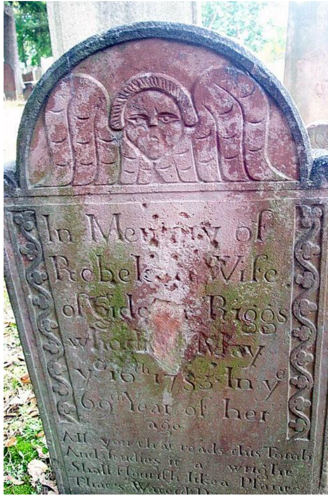
Figure 2. Gravestone of “Rebekah” (Hand) Riggs, wife of Gideon 1 , First Presbyterian Churchyard, Morristown