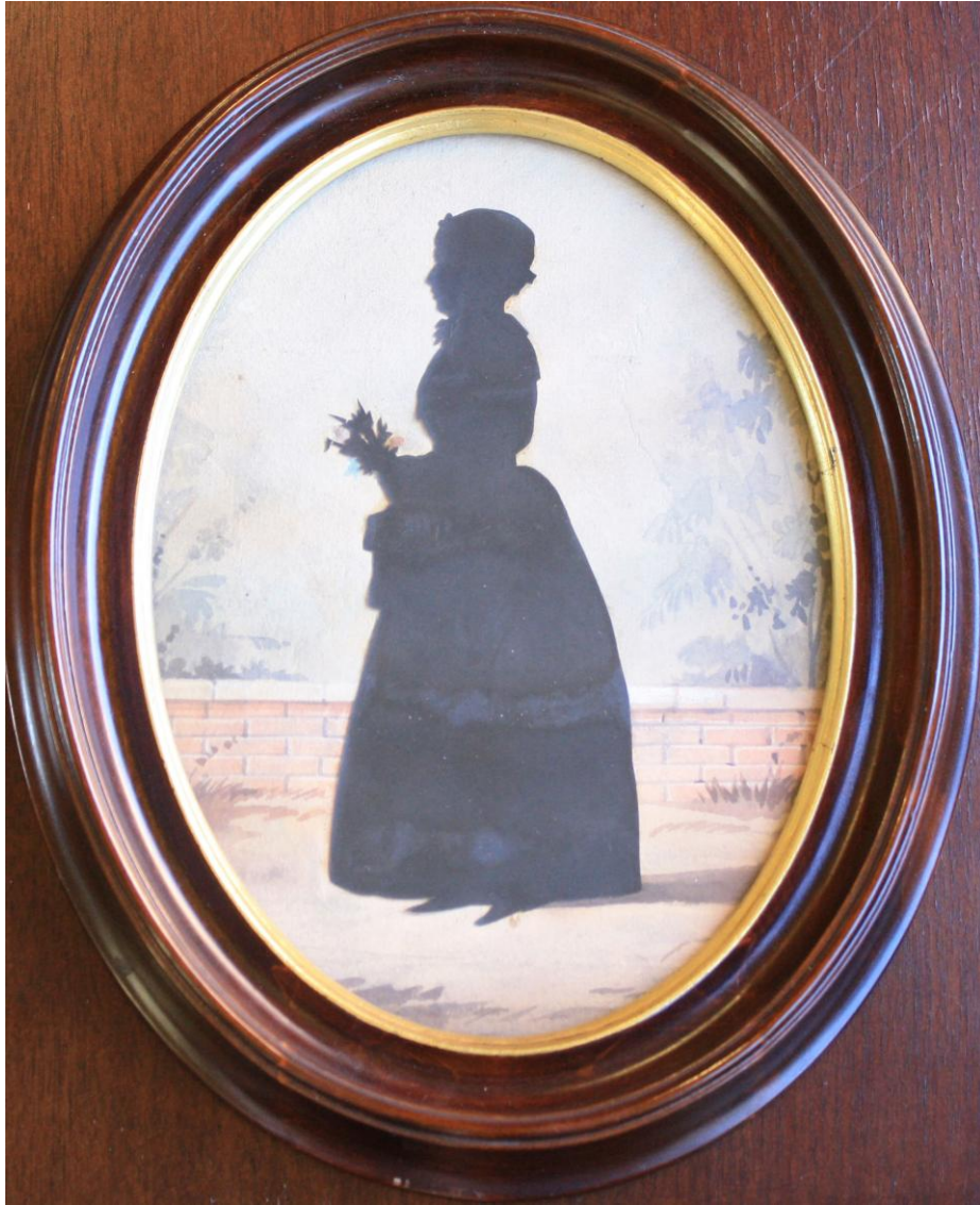
Figure 5. Rebecca (Hand) Riggs, wife of Gideon 1 , her silhouette from 1782