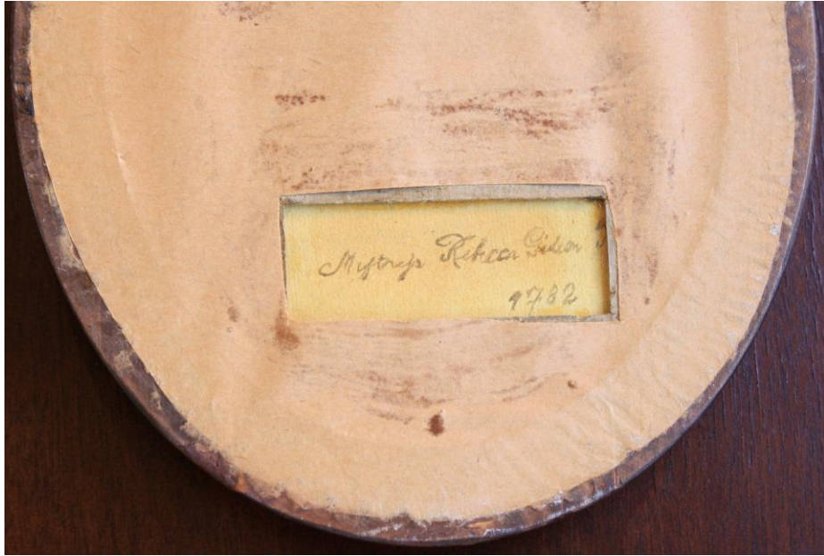
Figure 6. Reverse of Rebecca (Hand) Riggs's silhouette: "Mistress Rebecca Gideon R[iggs?] | 1782"