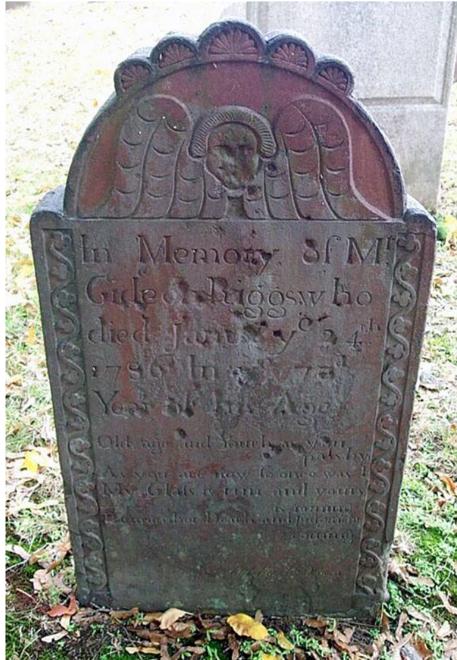
Figure 1. Gravestone of Gideon 1 Riggs, First Presbyterian Churchyard, Morristown, Morris Co., N.J., plot 31/71