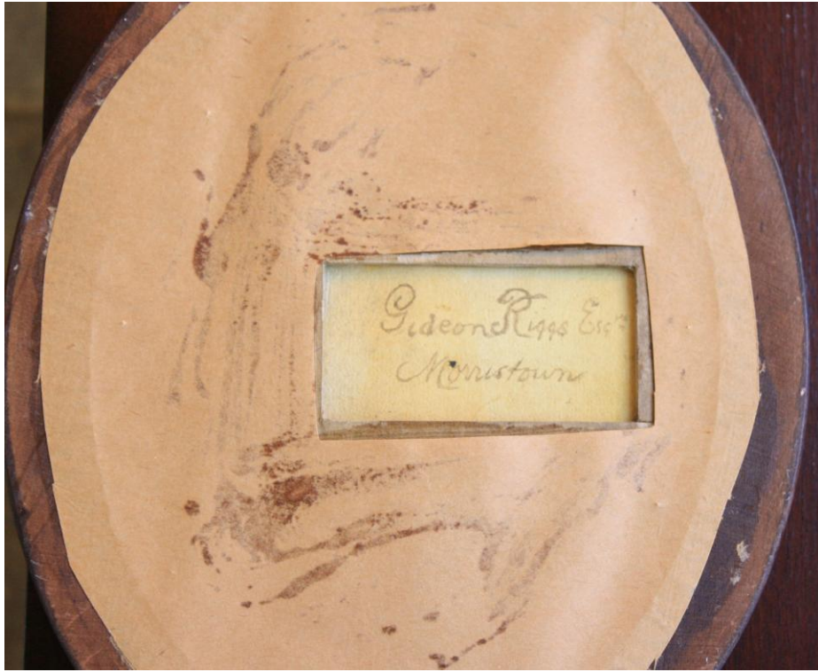
Figure 4. Reverse of Gideon 1 Riggs's silhouette: "Gideon Riggs Esq | Morristown"