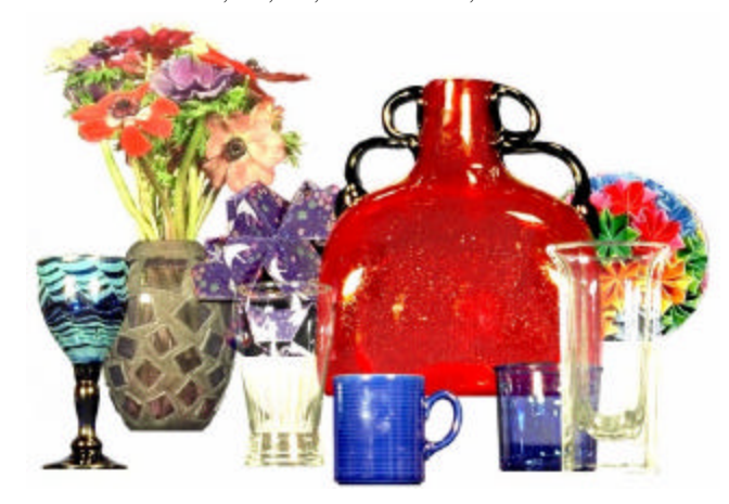
Figure 3. Composite of nine image sprites pulled from studio photographs using the triangulation technique shown in Fig. 2.