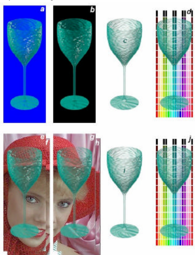
Figure 1. Ideal triangulation matting. (a) Object against known constant blue. (b)Against constant black. (c)Pulled. (d)Composited against new background. (e) Object against a known backing (f). (g) Against a different known backing (h). (i) Pulled. (j) New composite. Note the black pixel near base of (i) where pixels in the two backings are identical and the technique fails.

Let B_{k_1} and B_{k_2} be two shades of the backing color—i.e., B_{k_1} = cB_k and B_{k_2} = dB_k for 0 \le d < c \le 1 . Assume c_o is known