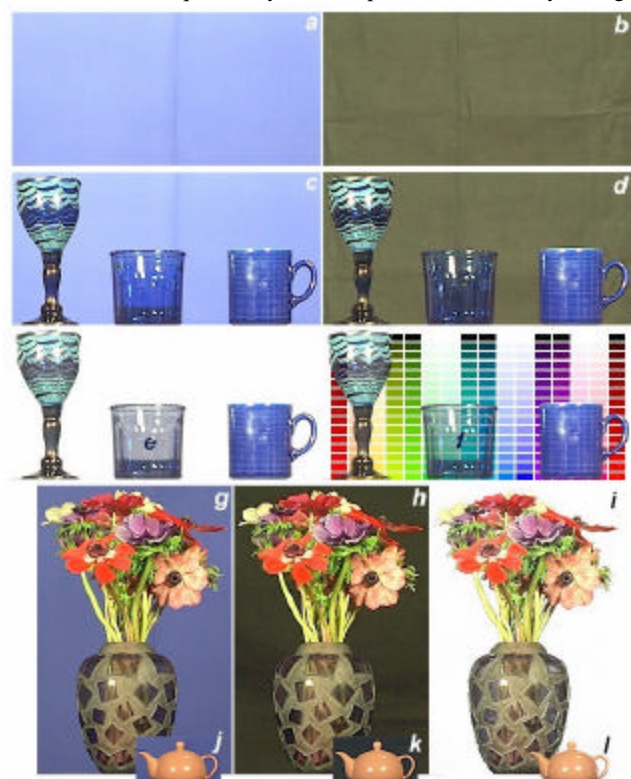
Figure 2. Practical triangulation matting. (a-b)Two different backings. (c-d) Objects against the backings. (e) Pulled. (f)New composite. (g-i) and (j-l) Same triangulation process applied to two other objects (backing shots not shown). (l) Object composited over another. The table and other extraneous equipment have been "garbage matted" from the shots. See Fig. 5.

The standard least squares way [7] to solve this is to multiply both sides of the equation by the transpose of the matrix yielding: