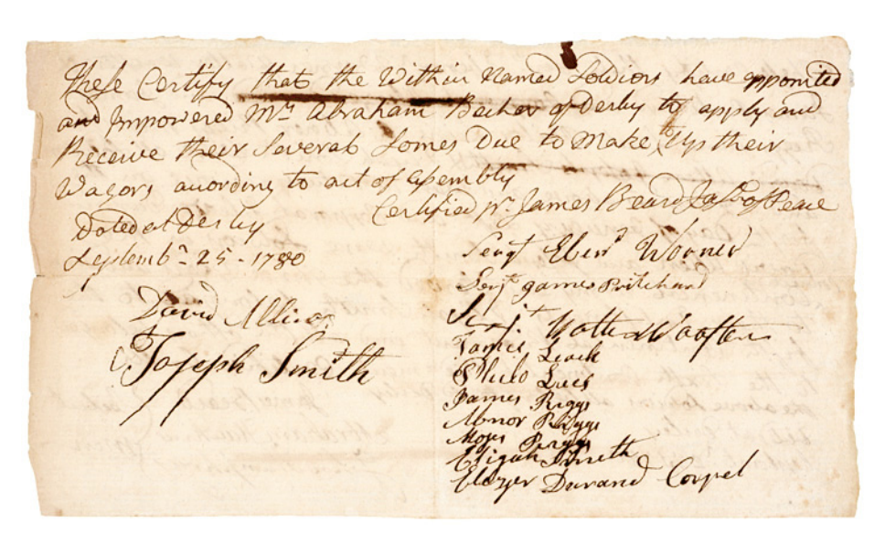
Figure 4. Obverse of previous figure.