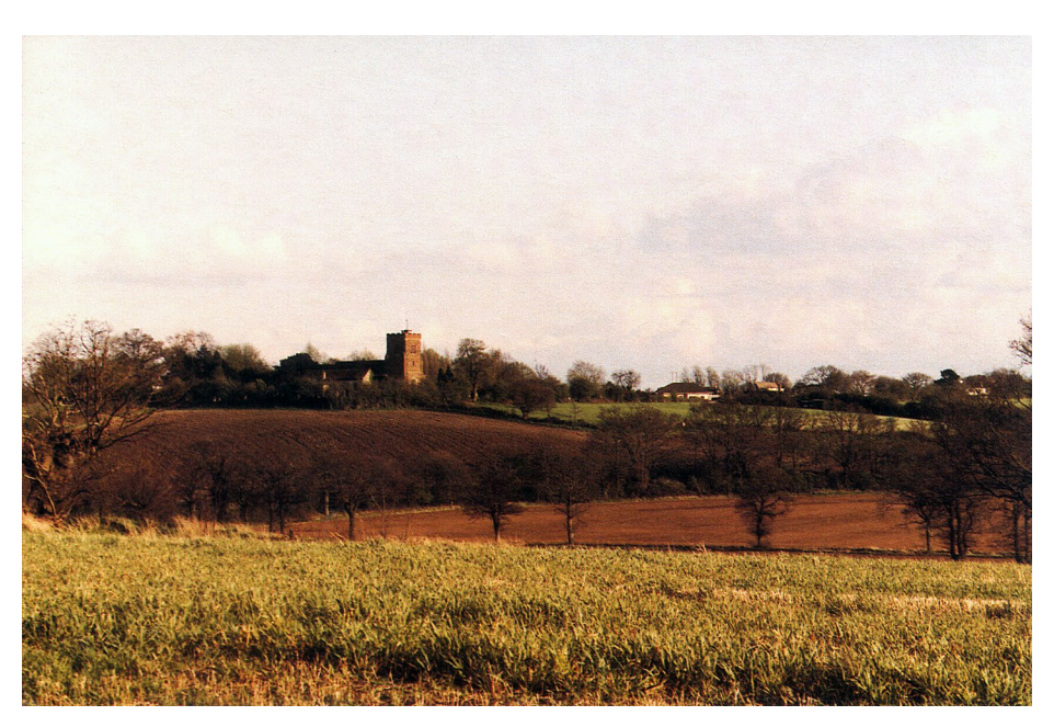
Figure 1. Nazeing Parish Church, Essex, England