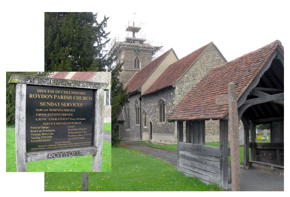
Figure 2. Roydon Parish Church, Essex, England